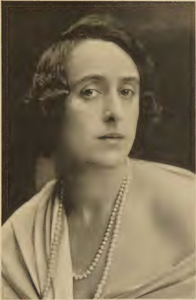
Orlando on her return to England